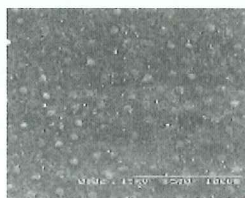
Tissue culture medium